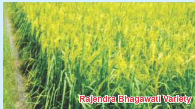
Rajendra Bhagwati Variety