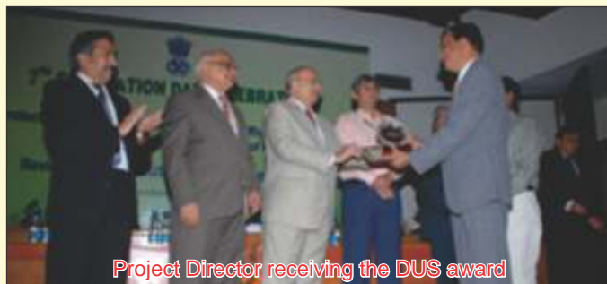
Project Director receiving the DUS award